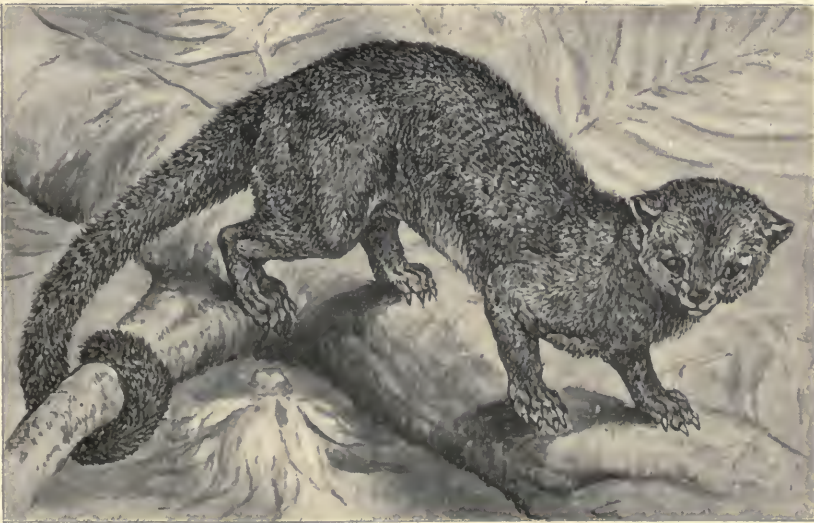
FIG. LIII. POTOS FLAVUS. THE KINKAJOU.